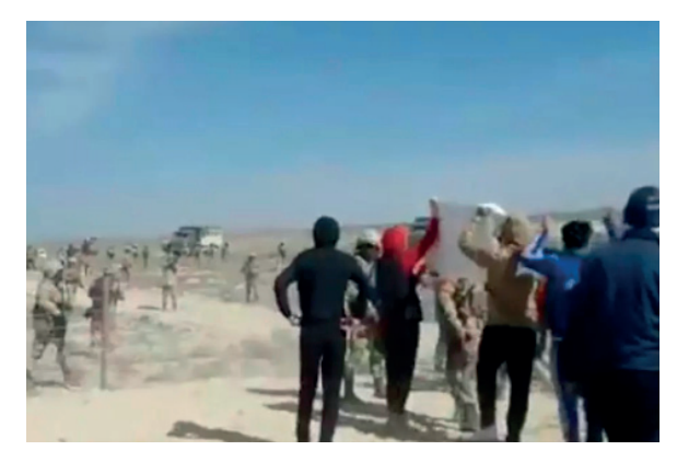
Scene from the video.

prevalence, format, and style of the texts are all similar to each other. For example, if a fake is circulated under the name of a brand. the following is necessarily noted: "on the occasion of the anniversary", "distributed for free", people are asked to answer a question and links to unclear sites are given. In addition, it uses the names of the most famous brands in Kazakhstan. For example, in 2021, topics such as "Tayota is holding a promotion on the occasion of the 100th anniversary"<sup>120</sup>, "Win 100,000 tenge from Air Astana"<sup>121</sup>, "Check your status and get 50,000"122, "Adidas gives free sneakers on the occasion of the 90th anniversary"123, "I will repay the loan for the Caspian" or "Halyk Bank is raffling off 100,000 tenge".<sup>124</sup>